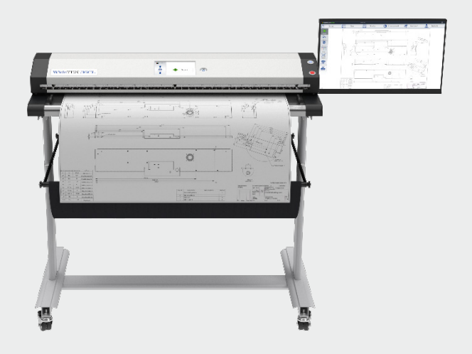
Large documents like maps rewind to the front or fall into the paper catch.

The WideTEK® 36CL produces extraordinarily sharp images, with color accuracy even superior to competing CCD scanners. Document rotation is done on the fly, a scan of an E-sized / A0 document in portrait mode at 300 dpi in 24bit color takes less than 7 seconds to scan and another 2 seconds to crop & deskew, preview and store.