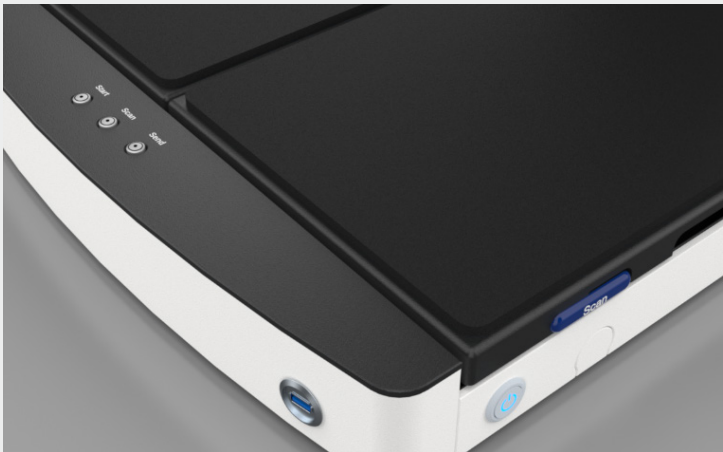
Store images directly to any USB devices via the USB 3.0 port