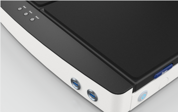
Store images directly to any USB devices via the USB 3.0 ports